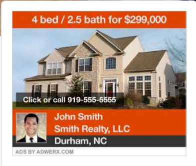
Sample Online Ad

*All wordmarks are the property of the respective owners. Adwerx, Inc. is not endorsed by or affiliated with the wordmark owners.